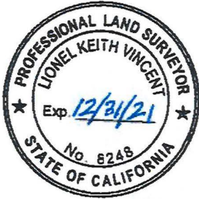
EXHIBIT A ANNEXATION OF 1499 LUCAS VALLEY ROAD

LANDS OF SOUANG Inst. No. 2014-0024717 APN 164-280-35 1501 LUCAS VALLEY ROAD